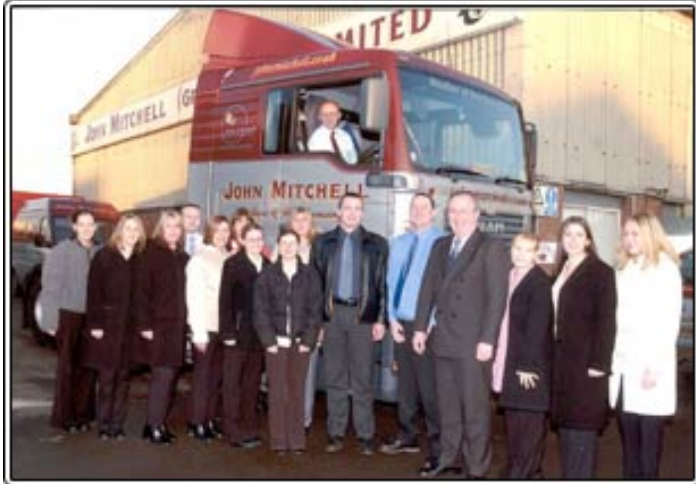
Happy New Year from our staff

Well here we are in 2003. What will it hold for us all? If I have not spoken to you, Happy New Year! Already, world events have made their mark on the global economy. Let us hope for a peaceful, lasting solution to these difficulties.